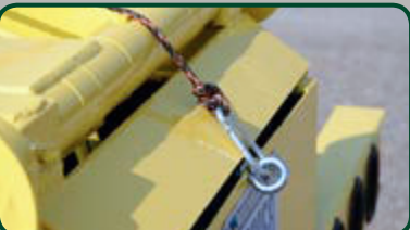
• Special tie-down hardware included to keep guide rope accessible and tidy