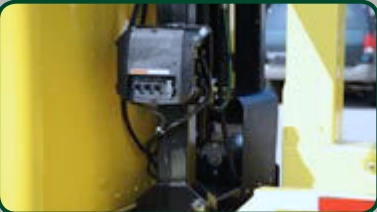
• Black Box™ Wireless Controls