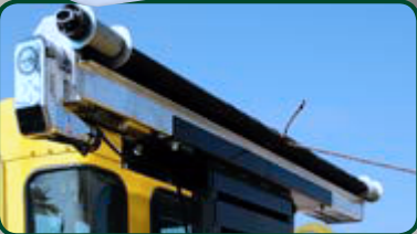
• Housing Surrounds Tarp & Spool For Protection Tower Adjusts 60" From Rest Position Up to 117"